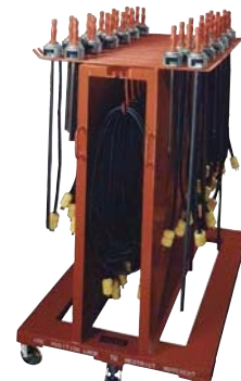
Bolt Heater Storage Cart