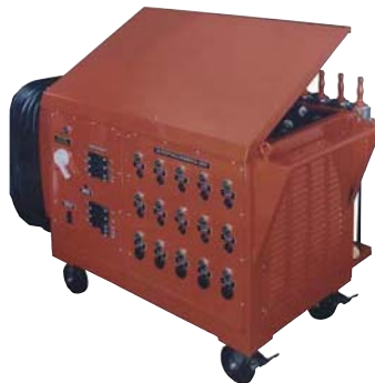
The "Outage Master" Distribution Center