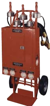
Portable Distribution Center